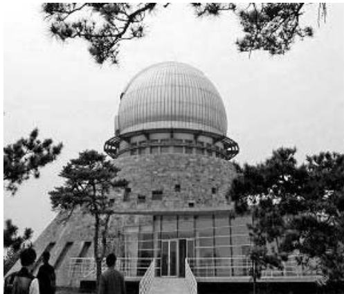
Figure 1. The dome for the telescope