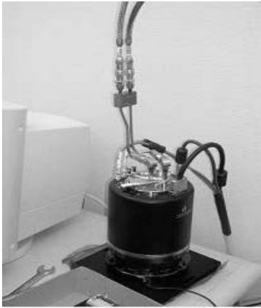
Figure 2. 4K by 4K CCD camera